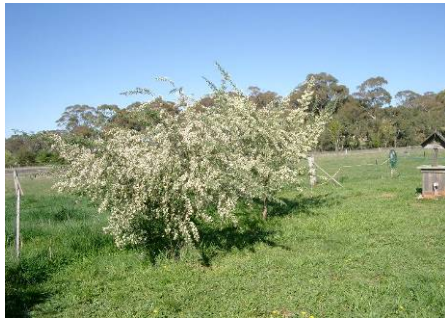
Plates 1 and 2. Tagasaste legume tree lookout

The second rule for grazing tagasaste is that it must be hard grazed and/or mechanically cut at least once in the first 6 months of the year. This prevents flowering, which has an adverse effect on subsequent tagasaste growth and palatability.