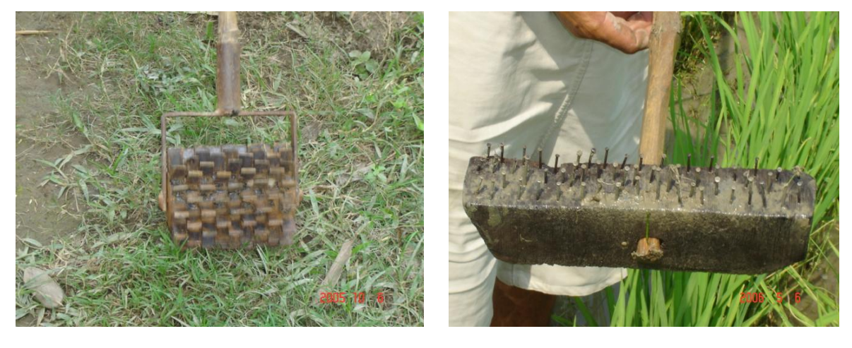
Plate 3 and 4. Farmer-made markers